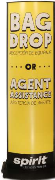
Standard Model: 22" X 72"