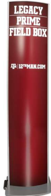
Standard Model: 22" X 92"